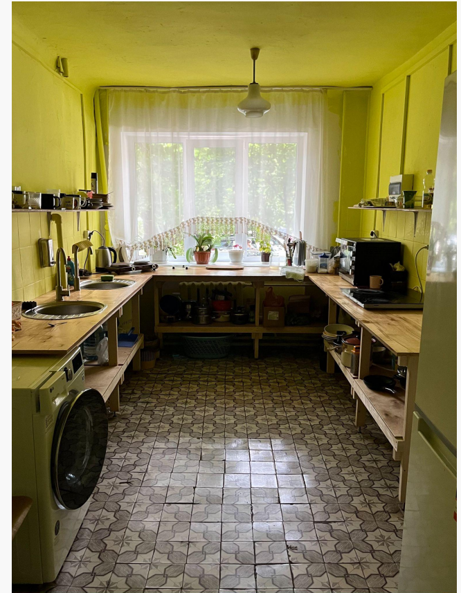
Collective accommodation site in Ivano-Frankivsk renovated by co-HATY