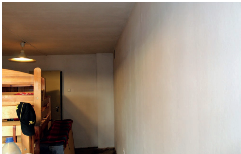
Effects of the works done with Credit Suisse volunteers