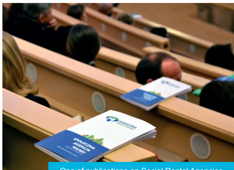
One of publications on Social Rental Agencies