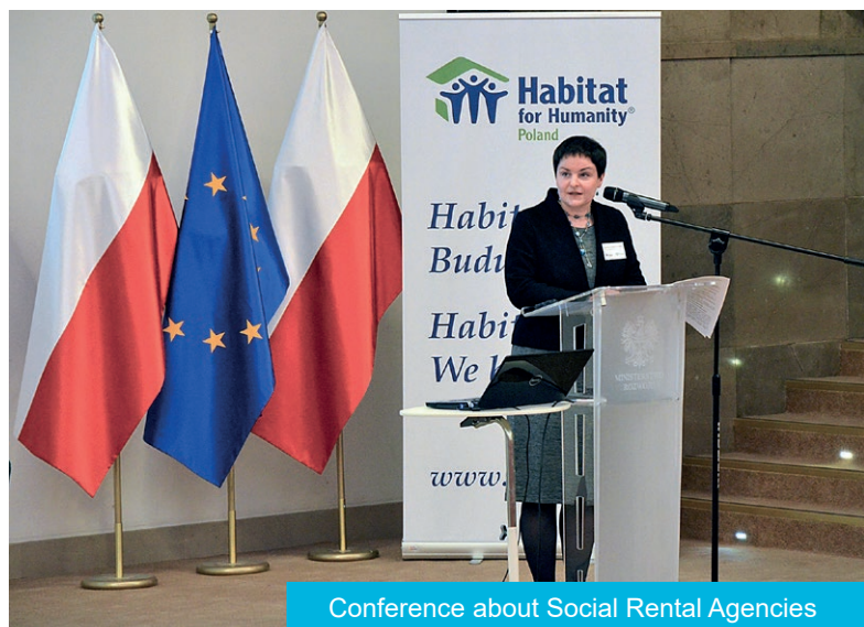
Conference about Social Rental Agencies at the Ministry of Development in Warsaw

The Social Rental Agency model involves private renters as providers of affordable housing units. A Social Rental Agency is a not-for-profit intermediary that negotiates between property owners and households in need of housing. To the owners, it guarantees regular rent payments and proper use of the housing unit in exchange for a discounted rent. For tenants, it offers long-term and affordable leases, up to 10 years, and apartments in good conditions.