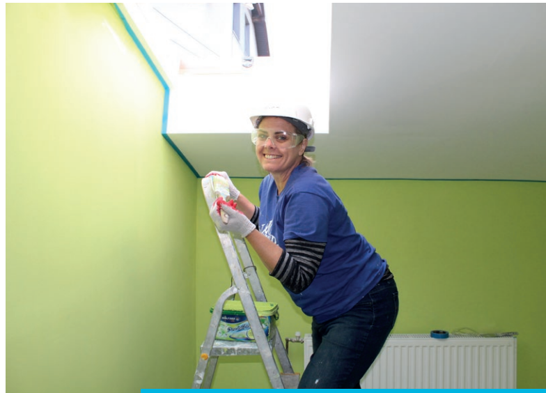
GV volunteers from the US in the house which is soon to be ready (April 2017)