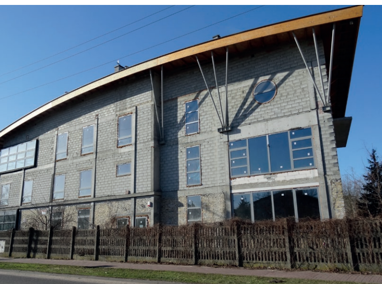
Youth Center for the Artistic and Spiritual Development