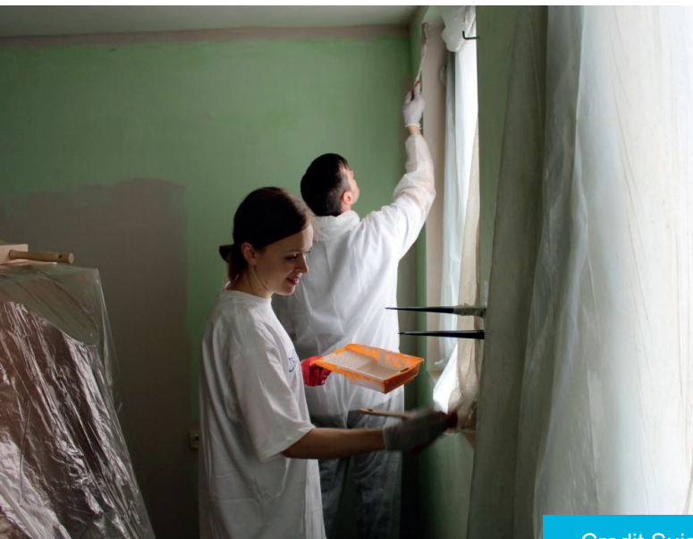
Credit Suisse volunteers