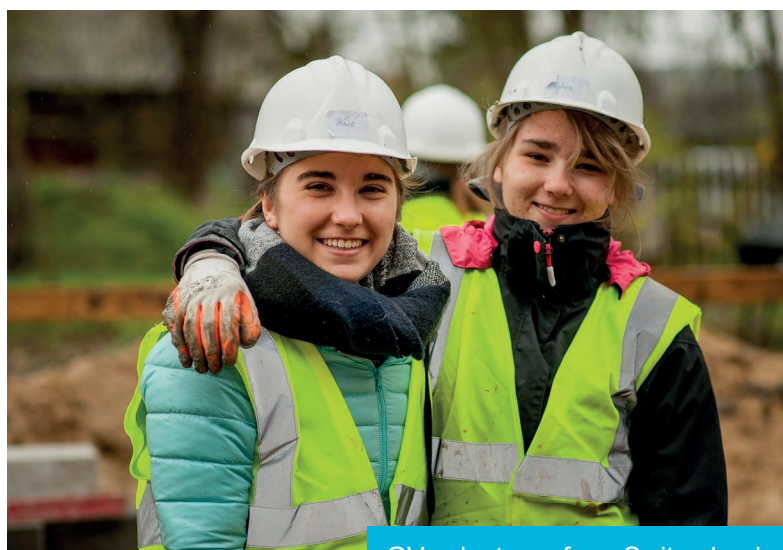
GV volunteers from Switzerland