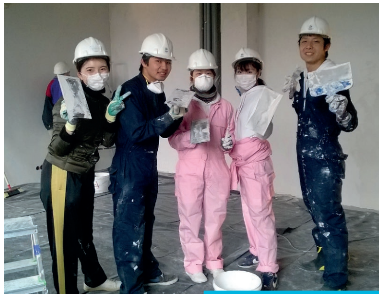
GV volunteers from Japan