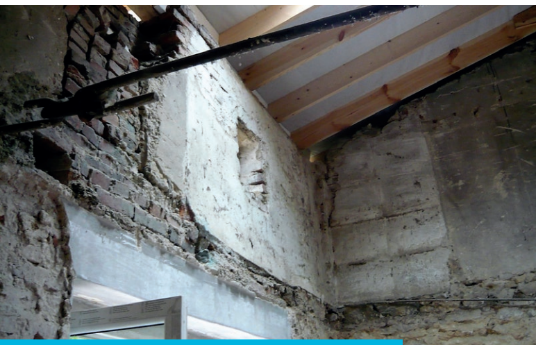
House before the first renovation works with Habitat Poland (July 2016)