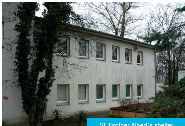
St. Brother Albert's shelter

We renovate the shelter with the support of corporate volunteers. In March we painted the interiors with 16 corporate volunteers from the Wrocław office of Credit Suisse.