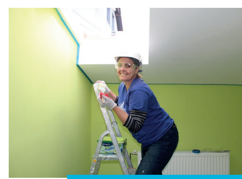
GV volunteers from the US in the house which is soon to be ready (April 2017)