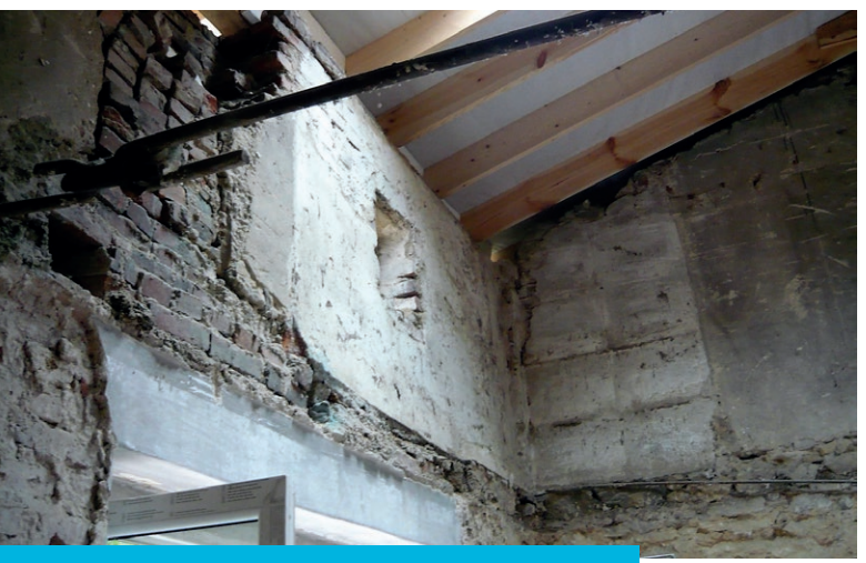
House before the first renovation works with Habitat Poland (July 2016)